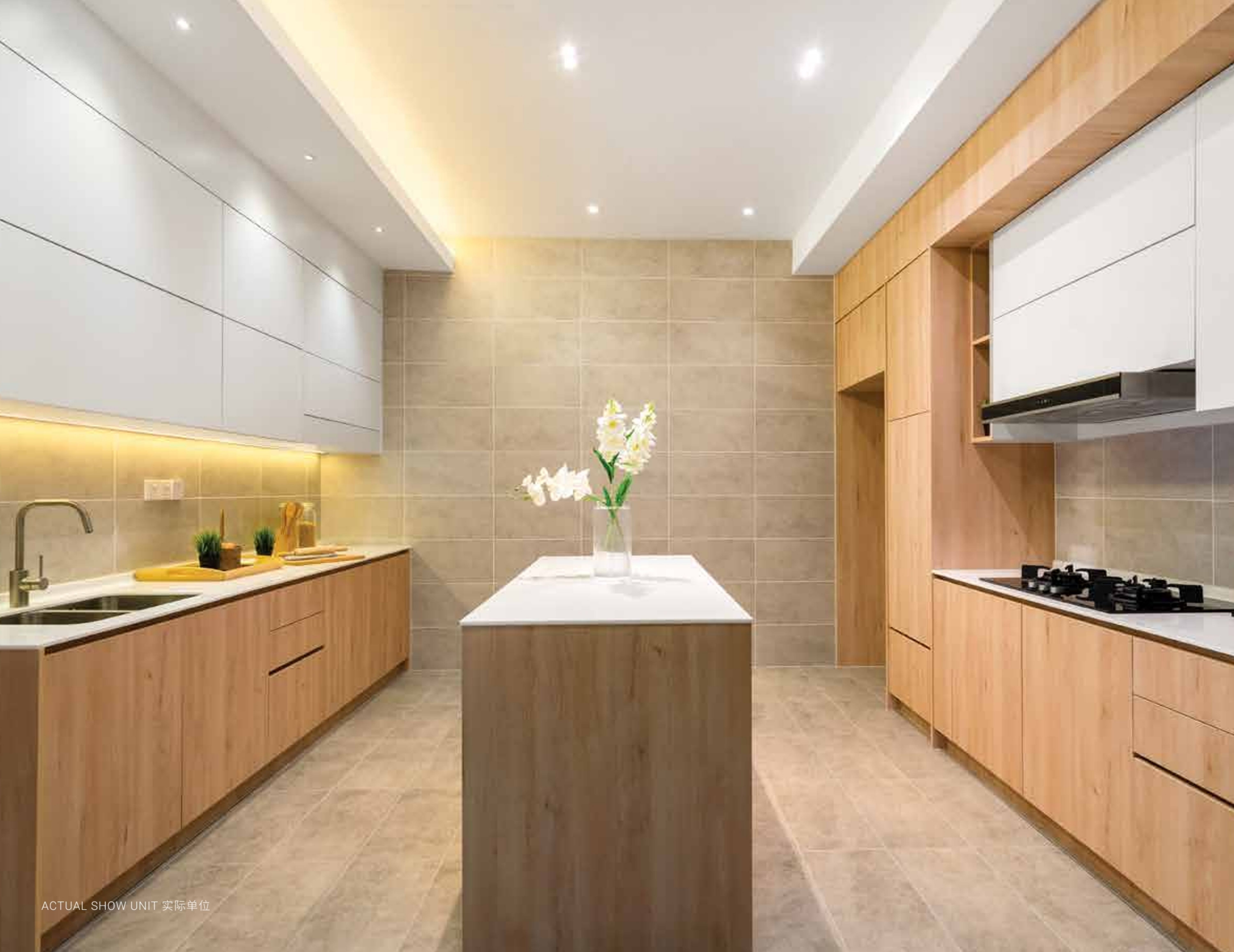
ACTUAL SHOW UNIT 实际单位