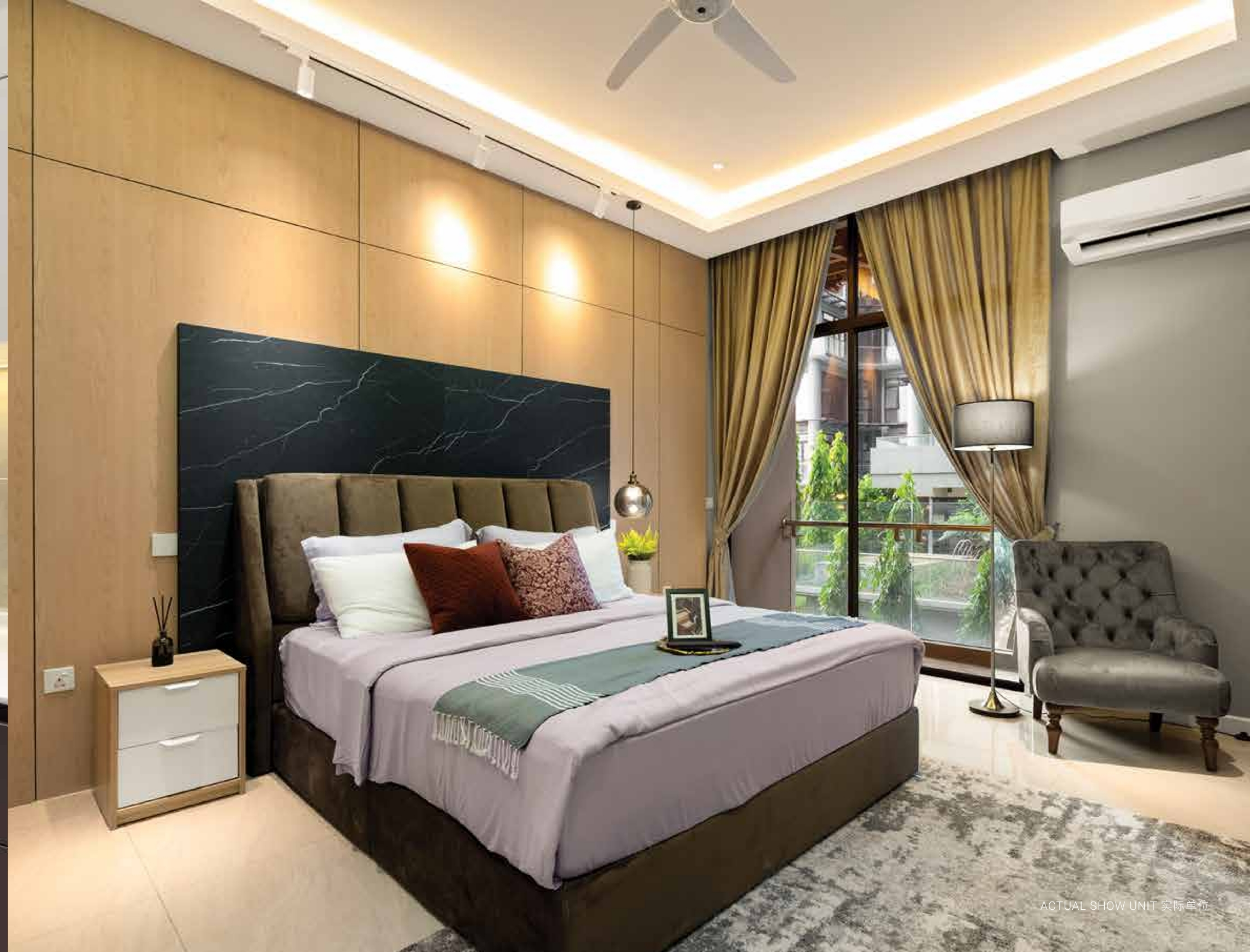
ACTUAL SHOW UNIT 实际单位