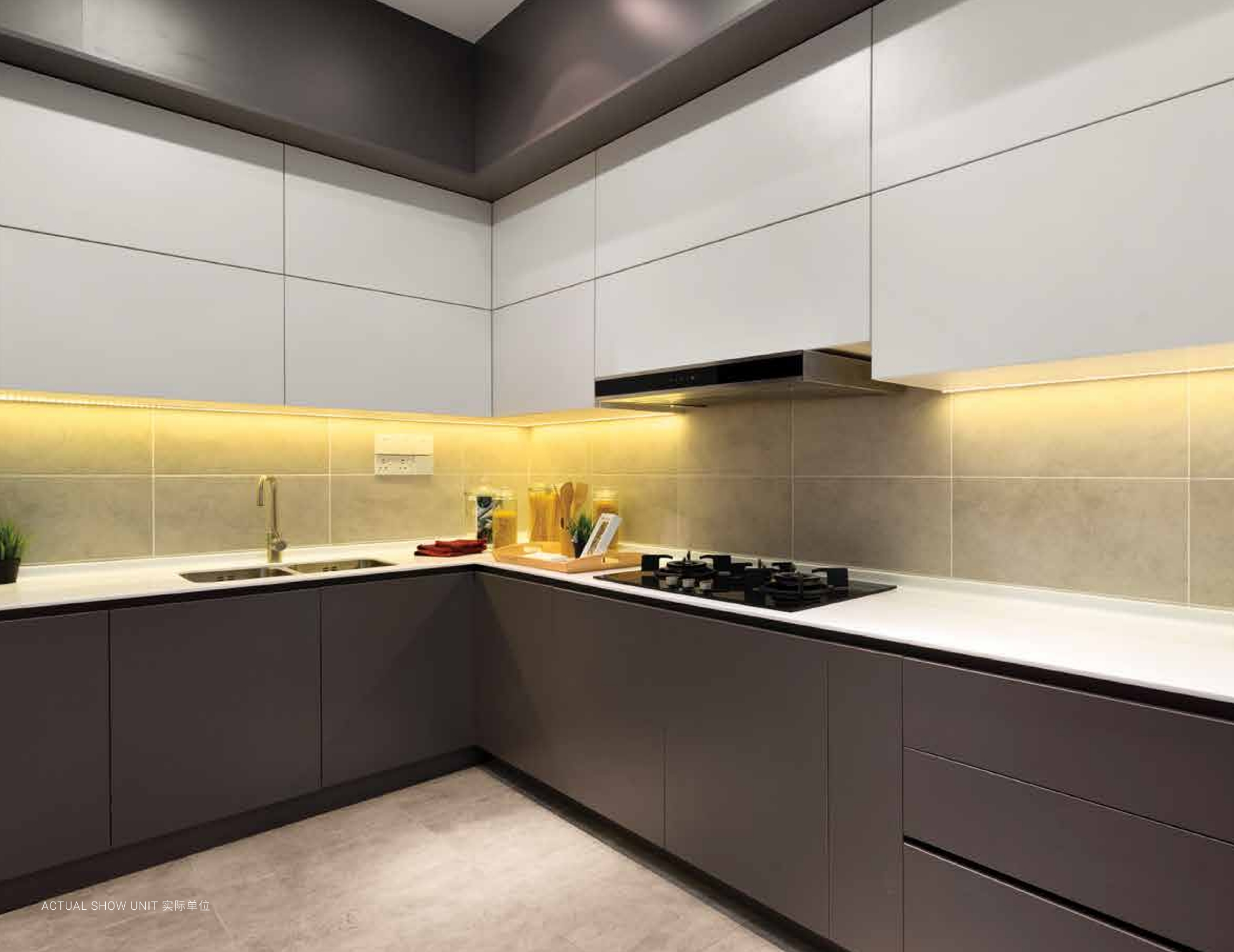
ACTUAL SHOW UNIT 实际单位