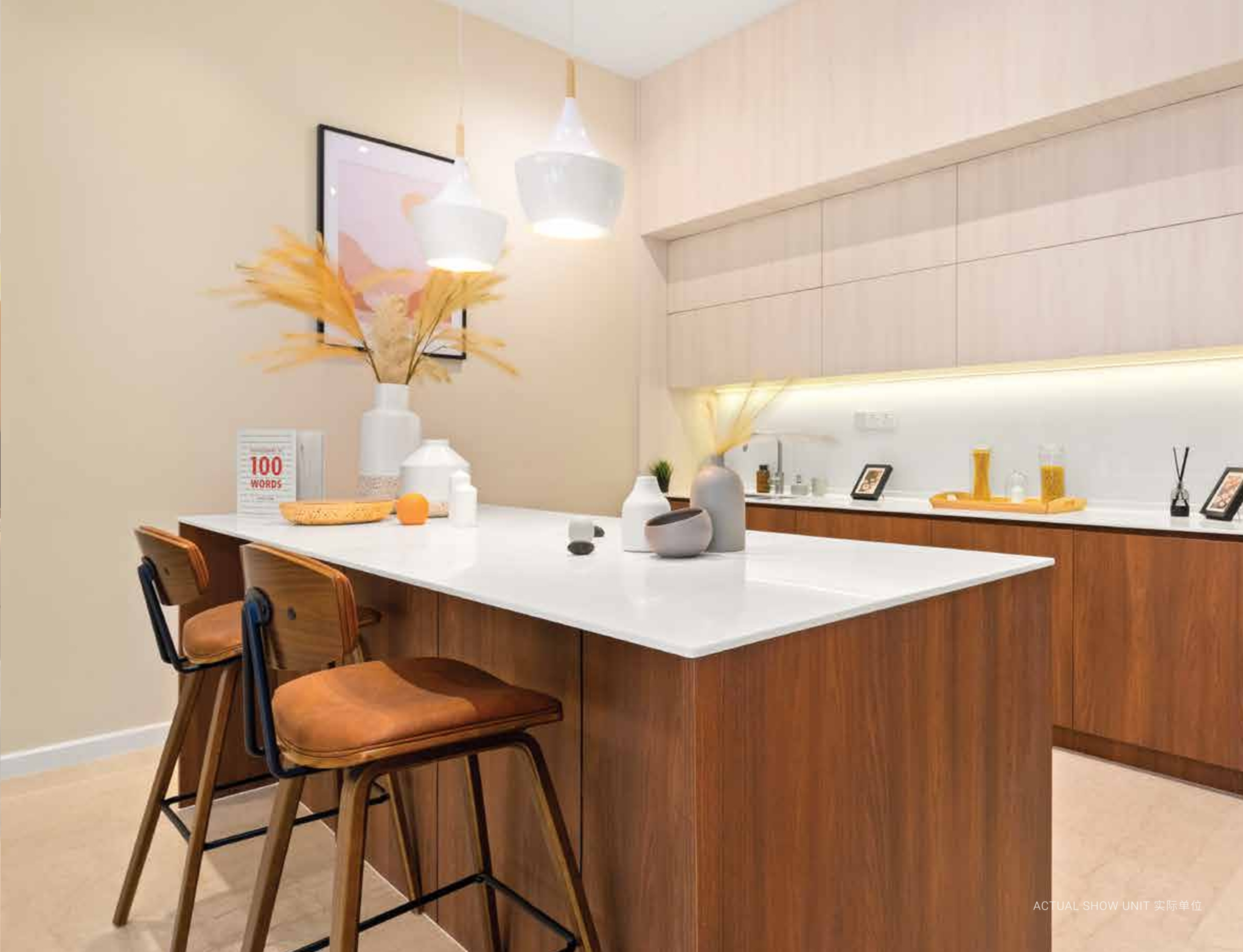
ACTUAL SHOW UNIT 实际单位