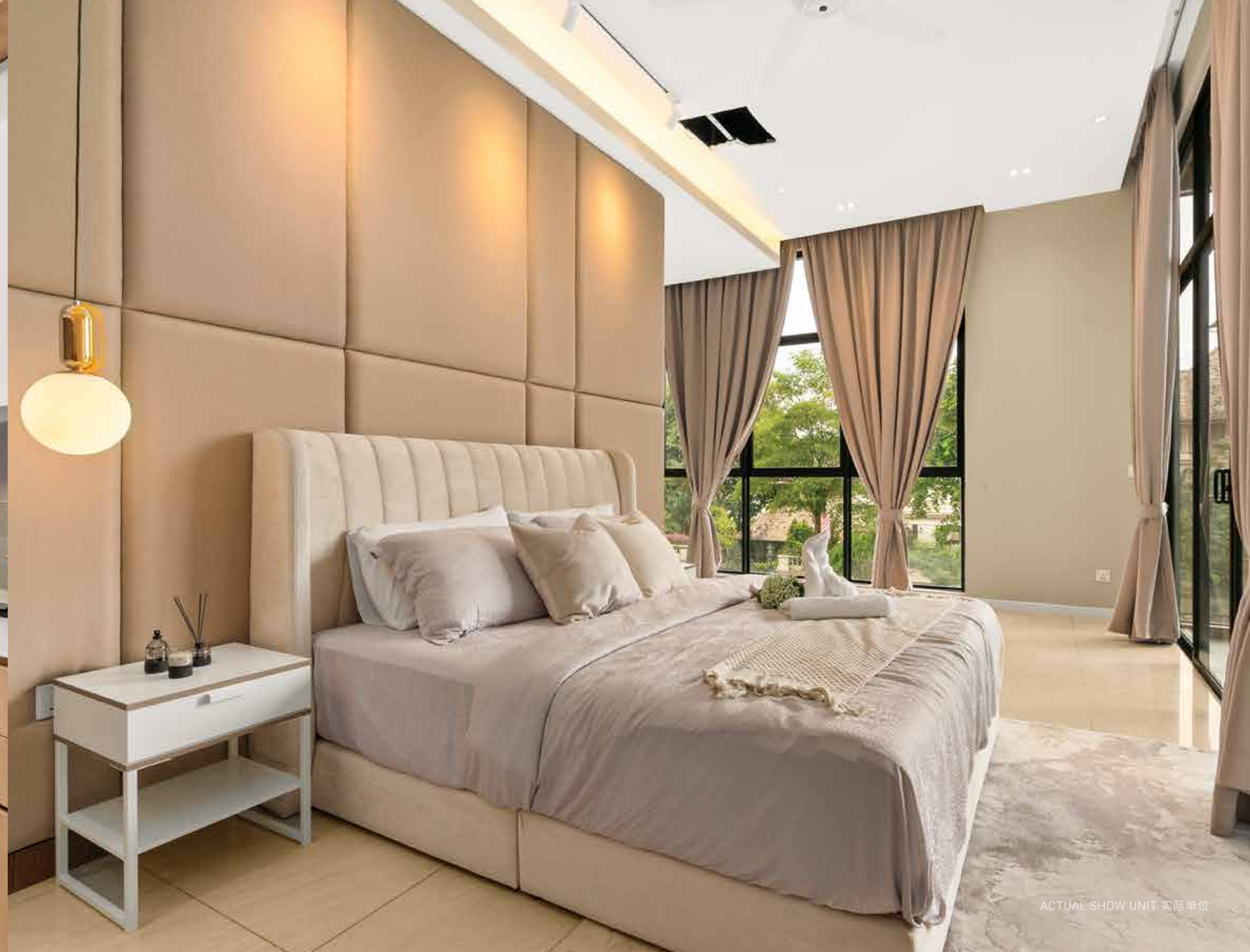
ACTUAL SHOW UNIT 实际单位