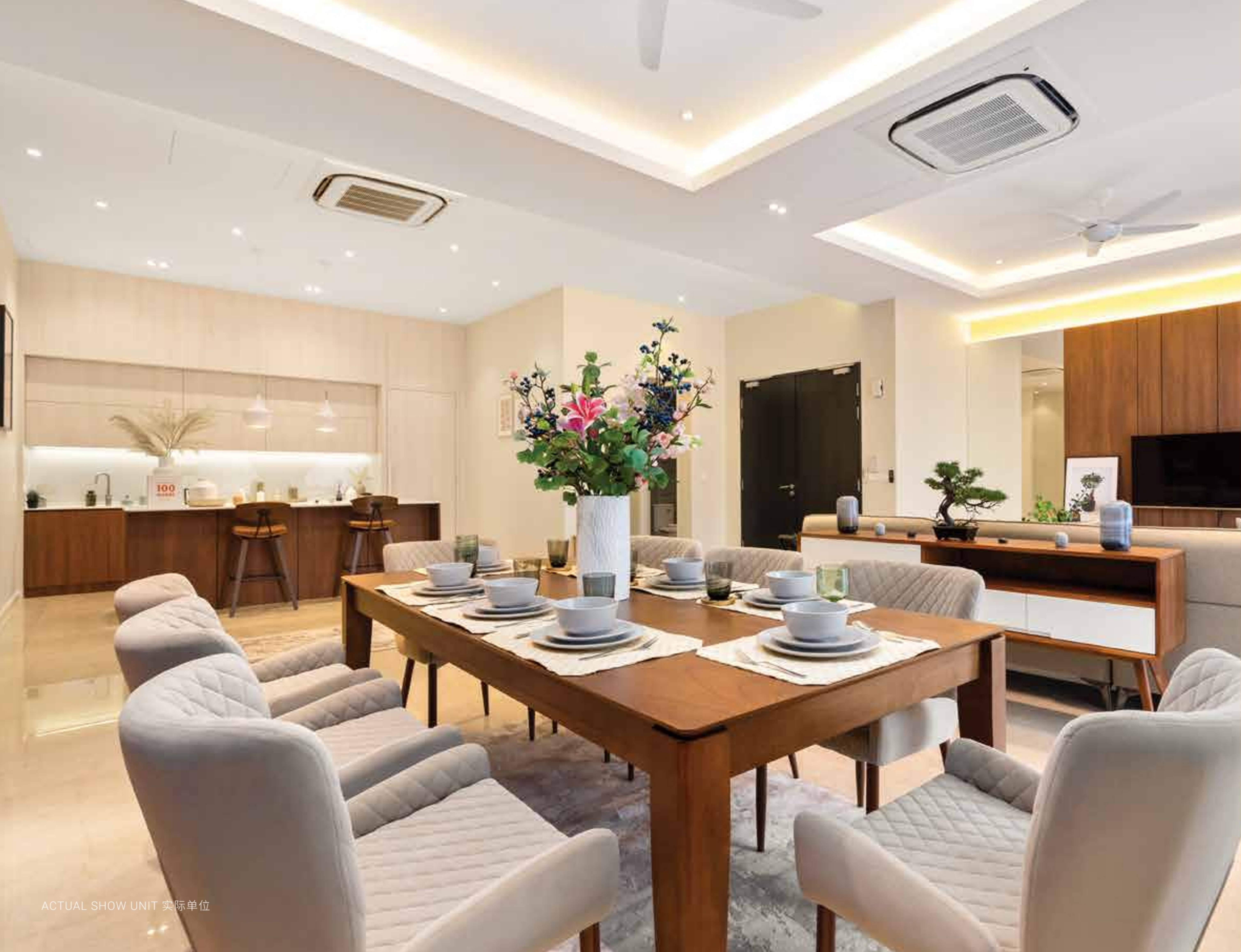
ACTUAL SHOW UNIT 实际单位